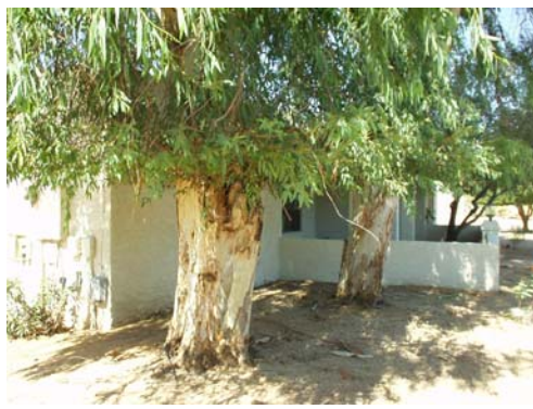
Tree Roots Can Damage Foundations