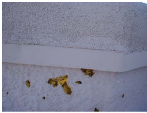
Foam Roofs Require Regular Inspection & Service