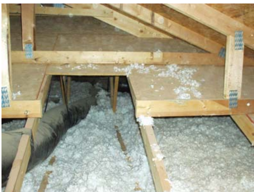
Trusses are an Engineered Product & Can Not be Modified