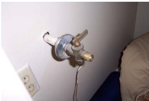
Unused Gas Valves need a Cap for Safety