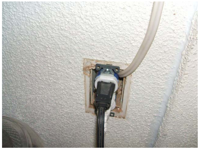
Unprofessional Electrical Work is Dangerous