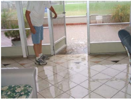
Flat Lot? Water will pond.