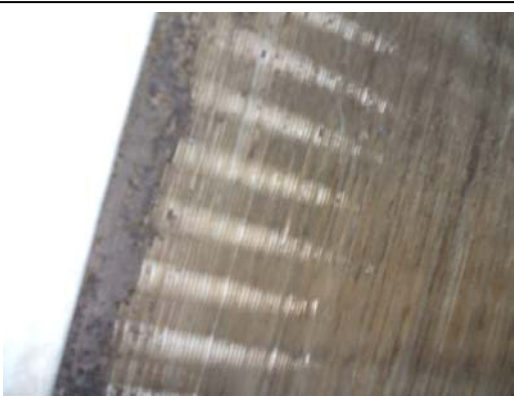
No HVAC Filter = Clogged AC Evaporator Coil

This month, I put together some reminders; through recent inspection pictures.