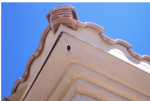
Stucco Holes Allow Bees to Nest in Walls