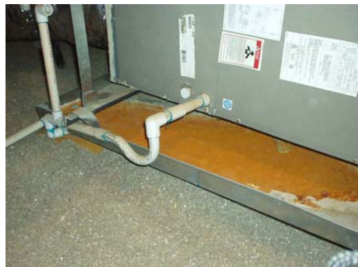
Water in Attic Secondary Pan means Primary HVAC Condensate Lines are Clogged