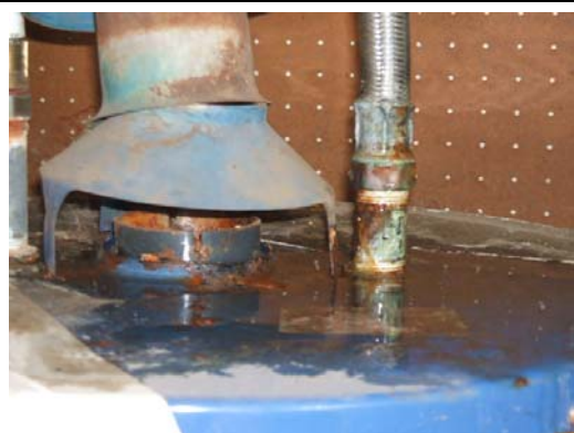
Check Water Heaters for Leaks